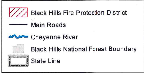
Exhibit A - Black Hills Fire Protection District